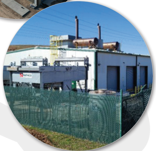
DeKalb Landfill Project 2019

At a renewable natural gas project at a landfill, the biogas is gathered at the wells, cleaned and reinjected into the gas pipeline systems. Nacelle utilizes its activated carbon H 2 S removal system and membrane separation technology to meet pipeline specifications gas quality throughout the lifecycle of the project.