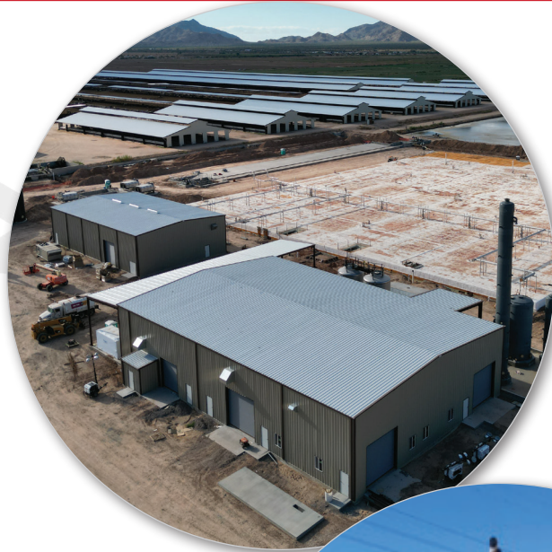
Milky Way Dairy Project 2022

Nacelle works with the developer to sequester greenhouse gas emissions on farms and create a renewable, a sustainable energy source while, generating new revenue for farmers. Nacelle's technology cleans, upgrades, and compresses biogas from organic waste captured by an anaerobic digester into renewable natural gas.